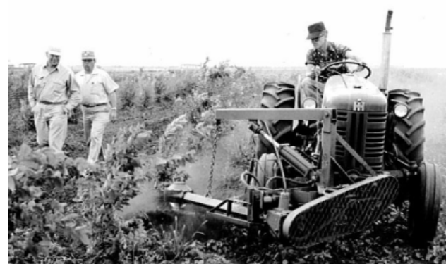
Past SWCD Technicians working with a landowner

Sherburne SWCD would like to remind county landowners of the technical and financial assistance opportunities that are available. Since 1944, the SWCD has worked with county landowners to protect soil, prairies, forests, wetlands, streams, lakes and groundwater from a variety of environmental stressors and pollutants. Staff are available to answer your conservation questions, visit your property for a site assessment, and provide technical assistance – many times at no cost to the landowner! Financial assistance is often available for conservation practices through state or county allocations and from successful grant applications which District employees pursue. In 2018, Sherburne SWCD will have three programs offering financial assistance (cost-share) for Sherburne County property owners.