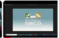
103 All about EAB 6 views • 1 month ago