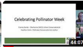
104 All Things Pollinators Podcast