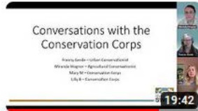
106 Conversations with the Conservation Corps

https://www.sherburneswcd.org/podcasts1.html