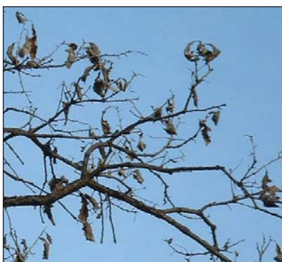
Figure 6.— Many dead leaves remain on the tree throughout the winter.

Submit samples to the National Plant Diagnostic Network (NPDN) Clinic in your respective State. To find a clinic near you, go to http://www.npdn.org/ .