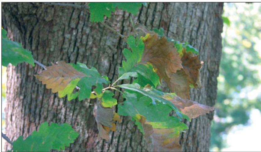
Figure 3.—Large areas of the leaf may die, resulting in an overall wilted or scorched appearance.