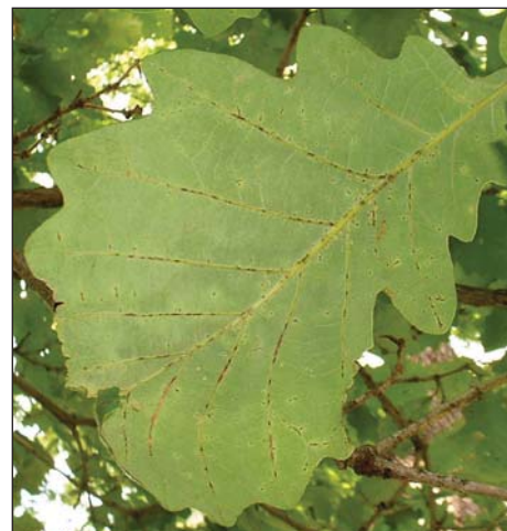
Figure 1.—Purple-brown lesions develop along the veins on the underside of leaves.

The disease tends to intensify from year to year in individual trees. If only a portion of the crown is affected, BOB symptoms usually start in the lower branches and progress up the tree. If a tree is seriously affected one year, it tends to be severely affected the next year. BOB appears to spread slowly, particularly from tree to tree. It remains a mystery why BOB does not spread more rapidly given the great abundance of spores that cause BOB and their spread by rain.