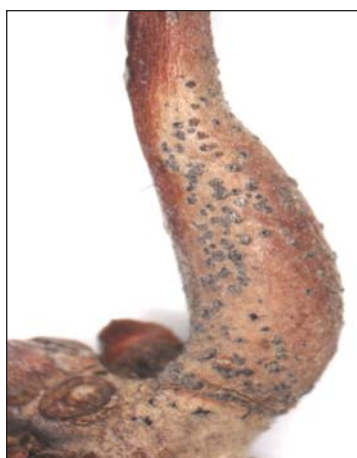
Figure 5.—Black pustules develop on infected leaf petioles.

Not all stands of bur oak are seriously affected by this disease. Even within a seriously affected stand, not all trees are equally susceptible. Some trees may be severely infected while adjacent trees appear healthy (figure 7). This is likely due to variation in the resistance of individual bur oak trees to this disease.