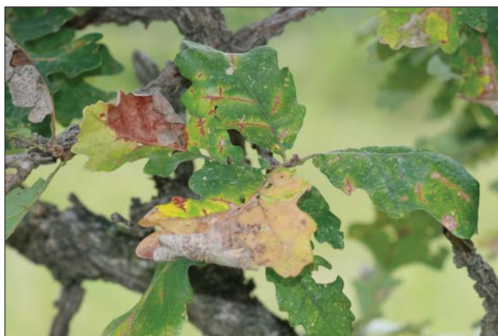
Figure 2.—Dark veins and large wedge-shaped lesions develop.