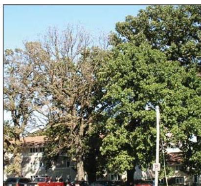
Figure 7.— Affected trees typically occur next to unaffected trees.