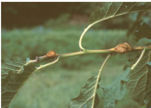
Figure 3. The early stages of knot formation results in only small galls.

The ascospores are spread by air currents and rain splashing. Mainly the succulent green shoots and, occasionally, wounded tissues are most susceptible to infection by ascospores. Ascospore discharge continues to occur for 2-3 weeks after bloom. Infections take place during this time but may continue for a longer time period if susceptible host plant tissue is available. The germinating ascospores have the ability to penetrate unwounded surfaces of elongating, green shoots directly.