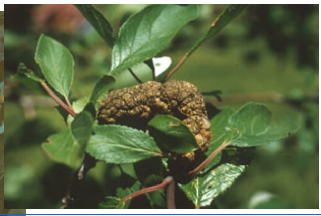
Figure 4. As knots develop, they become very soft in texture and are covered with olive-green conidia.