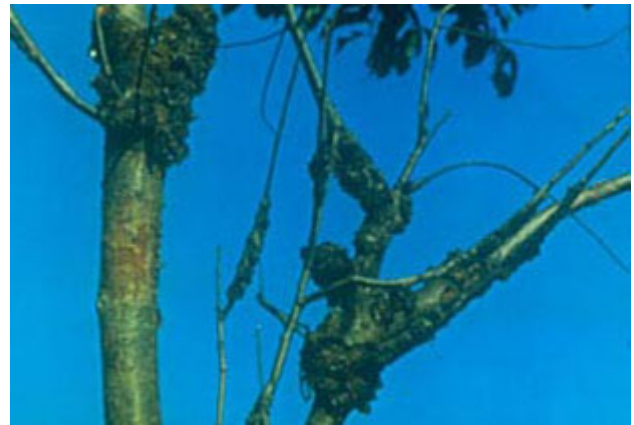
Figure 2: Galls caused by the fungus on cherry.