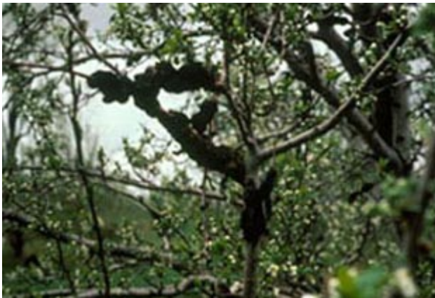
Figure 1: Branches appear thick and black.

Black knot disease occurs on numerous cultivated and wild plums, prunes, and cherries ( Prunus spp.). The disease is characterized by the presence of warty, black galls which may vary in size from 1/2 inch to more than 1 foot in length. In some parts of the Northeast and Midwest, black knot causes serious losses to commercial plum and prune growers. More often, however, the grotesque galls draw the attention from homeowners who want to improve the unsightly appearance of affected landscape trees. Black knot appears to be a minor problem on Prunus species found in forest situations, where susceptible trees are surrounded by many nonsusceptible species of trees. Black Knot is mainly a problem in North America (Canada, the United States and Mexico) where it is indigenous. A record from 1979 indicated the presence of the fungus on pear in Taiwan but no other incidences have been reported from Asia. Currently it is not found in Europe or the EPPO region. The EPPO region consists of 43 European and mediterranean countries that are responsible for international plant protection in their region. Apiosporina morbosa (syn. = Dibotryon morbosum ) is listed as an EPPO A1 quarantine pest. Inclusion on the list requires the countries to follow phytosanitary regulations and to make appropriate requirements for admission of plant material in their countries.