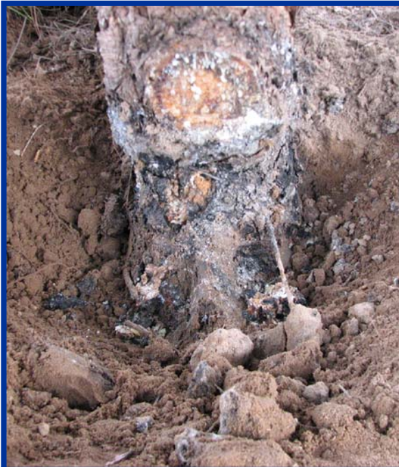
Black discoloration, reduced trunk size, and excessive production of pitch underground are classical symptoms of a pine root collar weevil infestation.

Control: An integrated approach to control that includes cultural, physical and chemical practices can help prevent and minimize the spread of pine root collar weevils. Control practices should include the following.