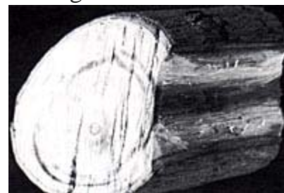
Figure 3. Discoloration in