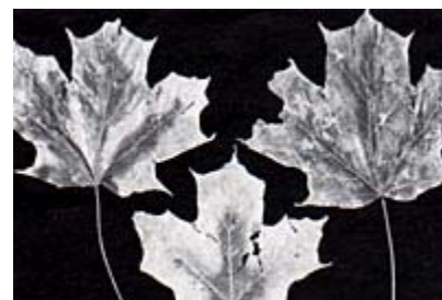
Figure 2. Yellowing of the foliage may precede wilting.