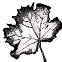
Figure 5. Verticillium wilt typically causes the margins of leaves to turn brown giving the leaf a scorched appearance.