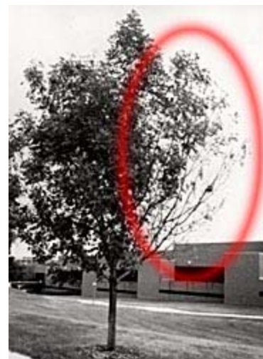
Figure 1. On small trees wilting, leaf scorch and defoliation can occur quickly on a large portion of the tree, as indicated by the circle.

In maple, the Verticillium fungus progresses around a growth ring by a combination of upward spread and tangential growth. If the pathogen fails to cross from one season's wood to the next, the result is remission of acute symptoms and compartmentalization (containment) of the