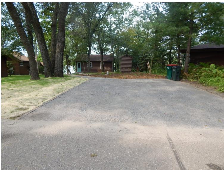
After Installation - August 2015