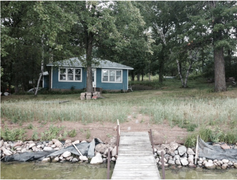
After Installation - August 2014