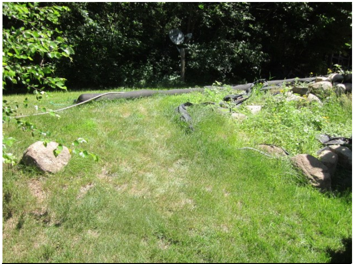
Temporary diversion of runoff into the raingarden - planning for a dry creek bed next year