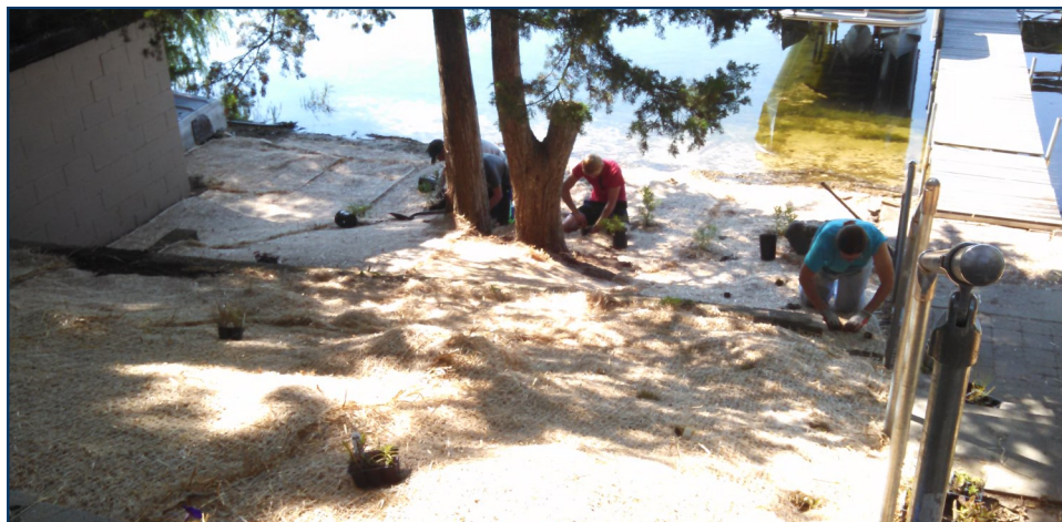
Planting native shrubs and plant plugs