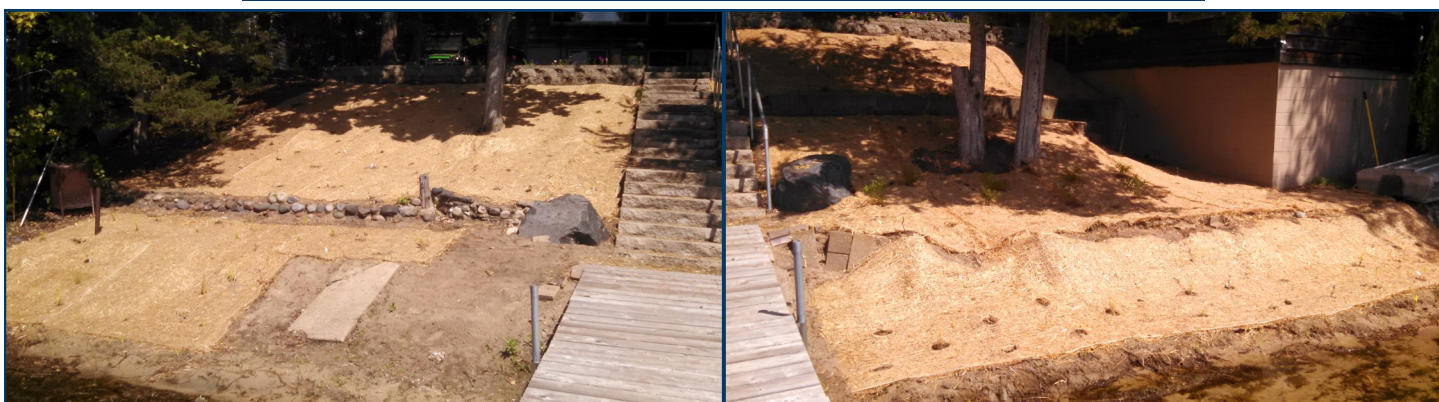
After Installation - August 2014