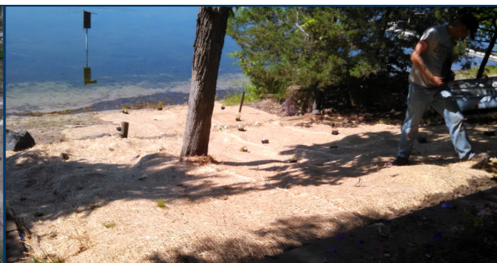
Placing plants after seeding and laying out erosion control blanket