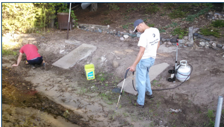
Hand weeding and weed torch before planting