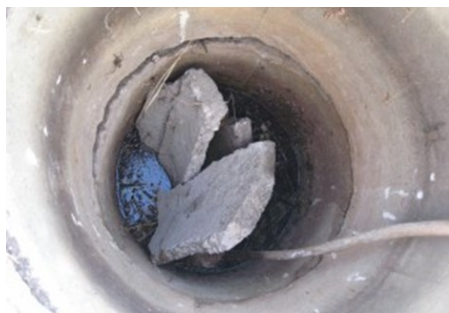
Debris in an unused and unsealed well