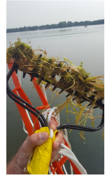
Native plants on a sampling rake