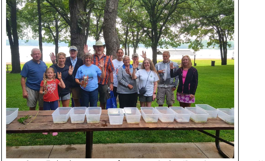
Starry Trek volunteers pose after an aquatic plant ID session