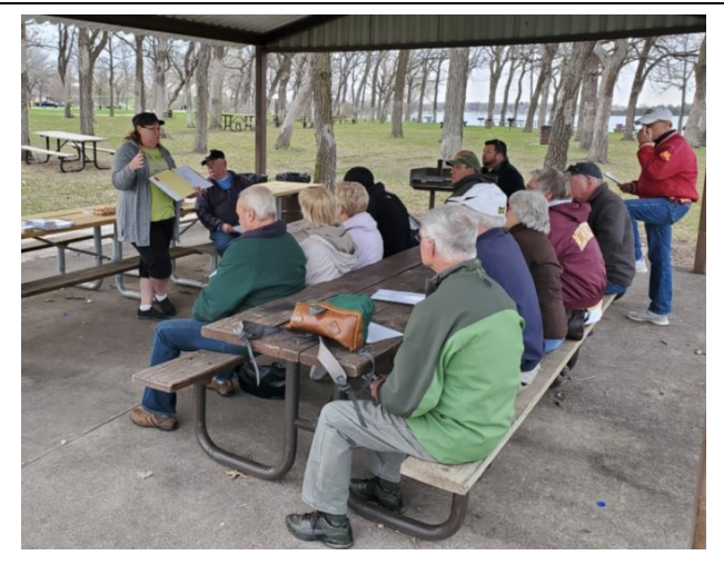
A Big Lake Community Lakes Association member leads a local discussion on AIS Volunteer Outreach for the Big Lake Public Access.