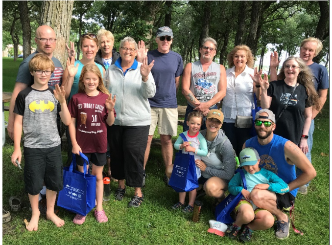
16 volunteers had fun in the sun during the annual Starry Trek AIS event.