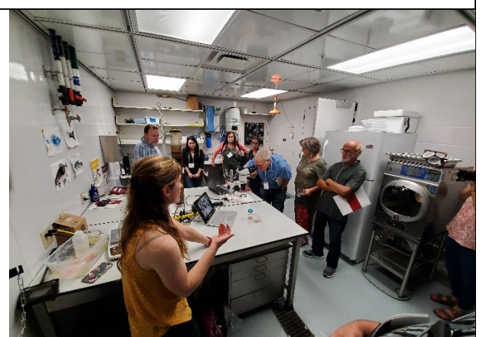
Sherburne County residents and AIS Task Force members visit a laboratory at the University of Minnesota during the annual AIS Research and Management Showcase.