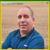
Tanner Tool AquaSpy