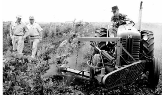
Past SWCD Technicians working with a landowner

Sherburne SWCD would like to remind county landowners of the technical and financial assistance opportunities that are available. Since 1944, the SWCD has worked with county landowners to protect soil, prairies, forests, wetlands, streams, lakes and groundwater from a variety of environmental stressors and pollutants. Staff are available to answer your conservation questions, visit your property for a site assessment, and provide technical assistance – many times at no cost to the landowner! Financial assistance is often available for conservation practices through state or county allocations and from successful grant applications which District employees pursue. In 2018, Sherburne SWCD will have three programs offering financial assistance (cost-share) for Sherburne County property owners.