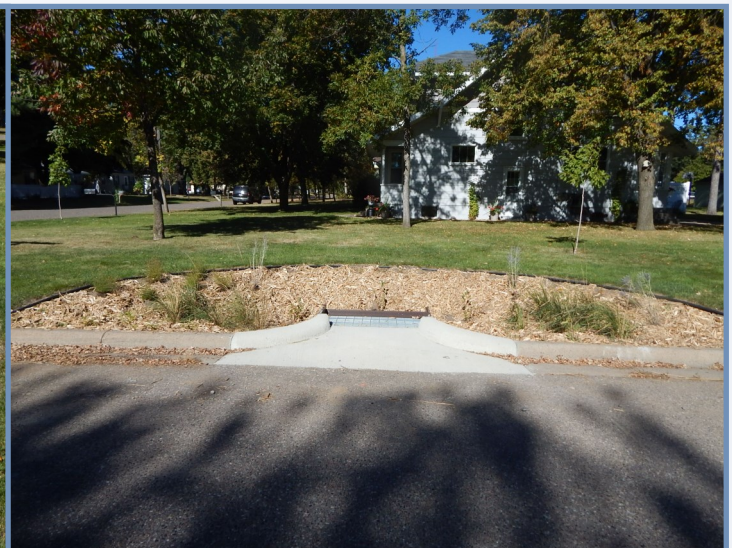
Completed September 2015