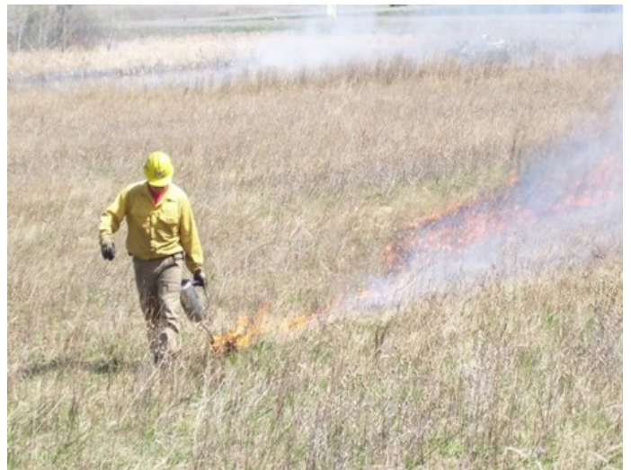
Prescribed Burn 2010