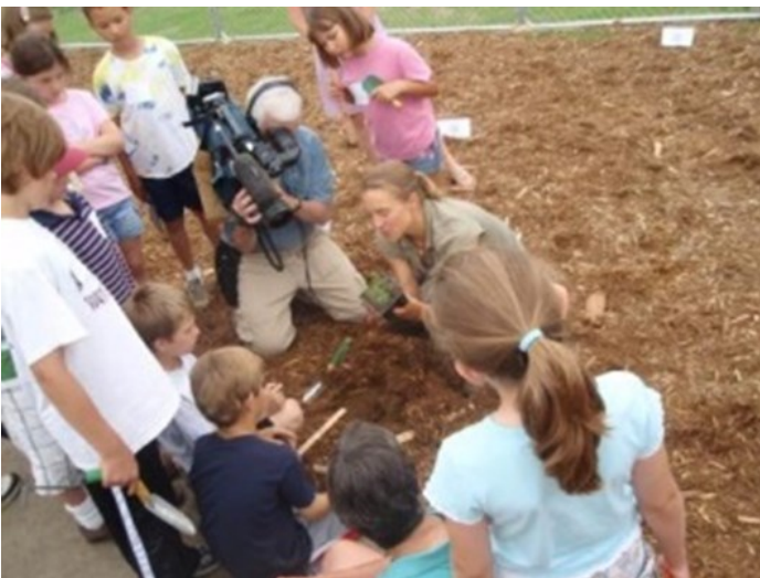
KARE 11 filming youth pollinator garden planting in 2009