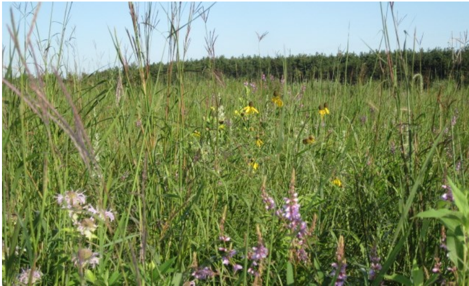
Just a few of the many native flowers and grasses in bloom mid summer of 2011